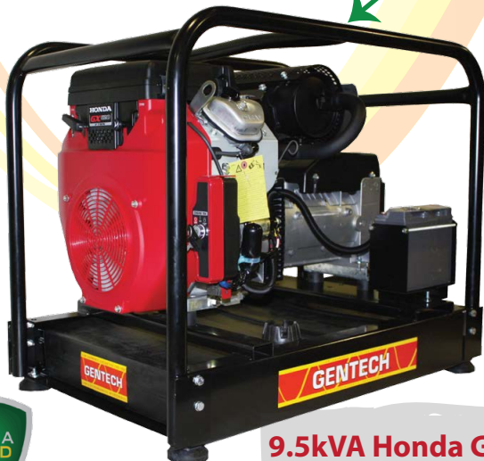
9.5kVA Honda Generator Model: EP9500HSRE