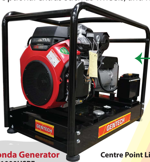
11kVA Honda Generator Model: EP11000HSRE