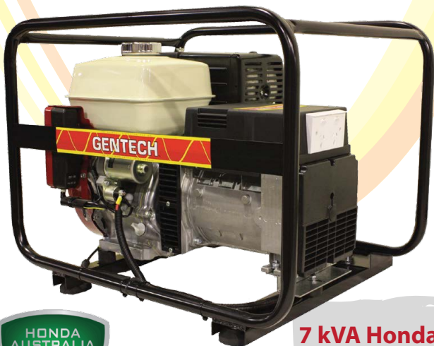
7 kVA Honda Generator Model: EP7000HSR/3 *